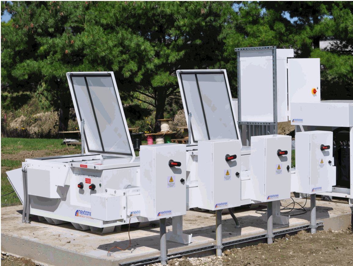
September 16, 2014