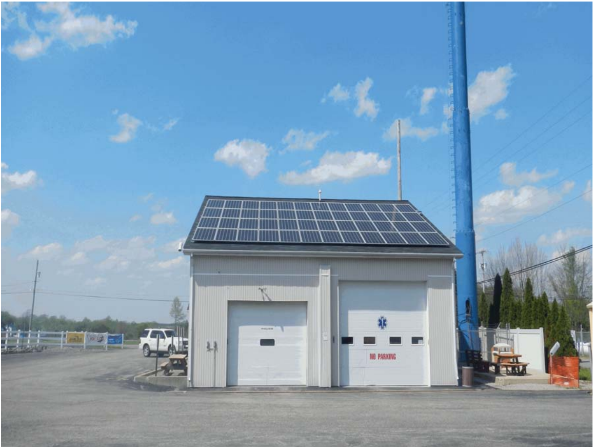
May 22, 2014