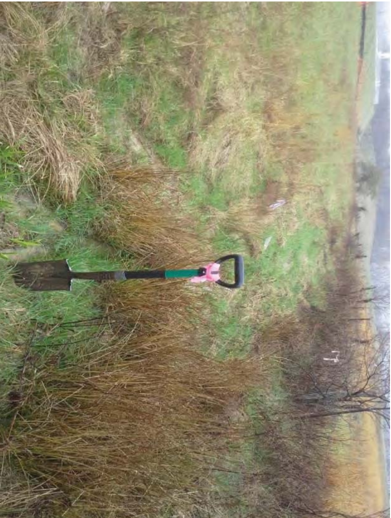
Photo 15: Representative PEM wetland WRG002, looking southwest to Kilgore compressor station.