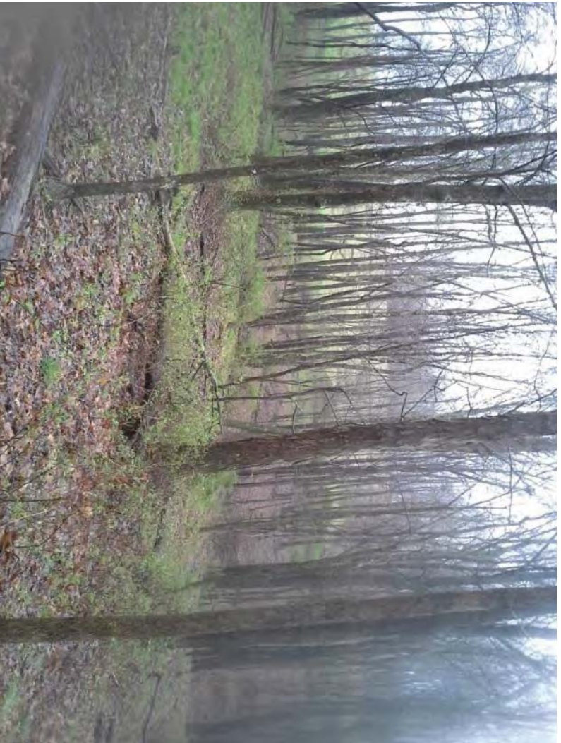
Photo 4: Forest northwest of Kilgore compressor station and north of proposed ROW looking southeast.