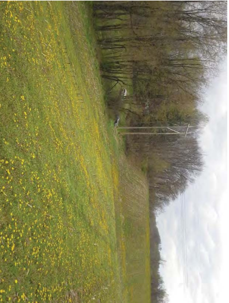
Photo 14: Open agricultural field northeast of existing power line, looking west-southwest to powerline.