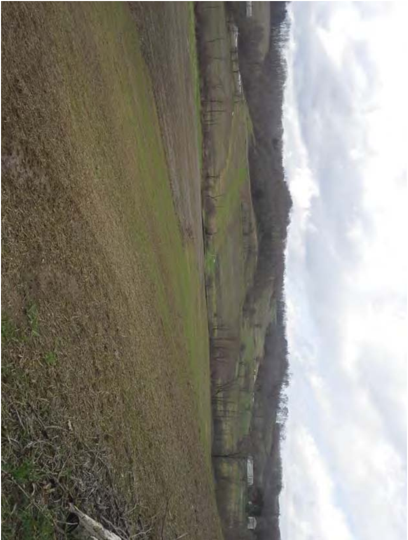
Photo 7: Proposed 138kV ROW centerline near Pontiff Road looking northwest to WRG007.