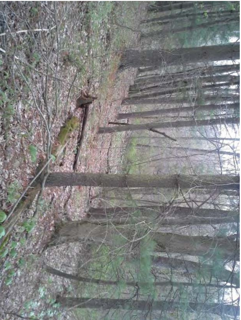
Photo 10: Proposed 138kV ROW centerline near south edge of tree farm, looking southeast into white pines.