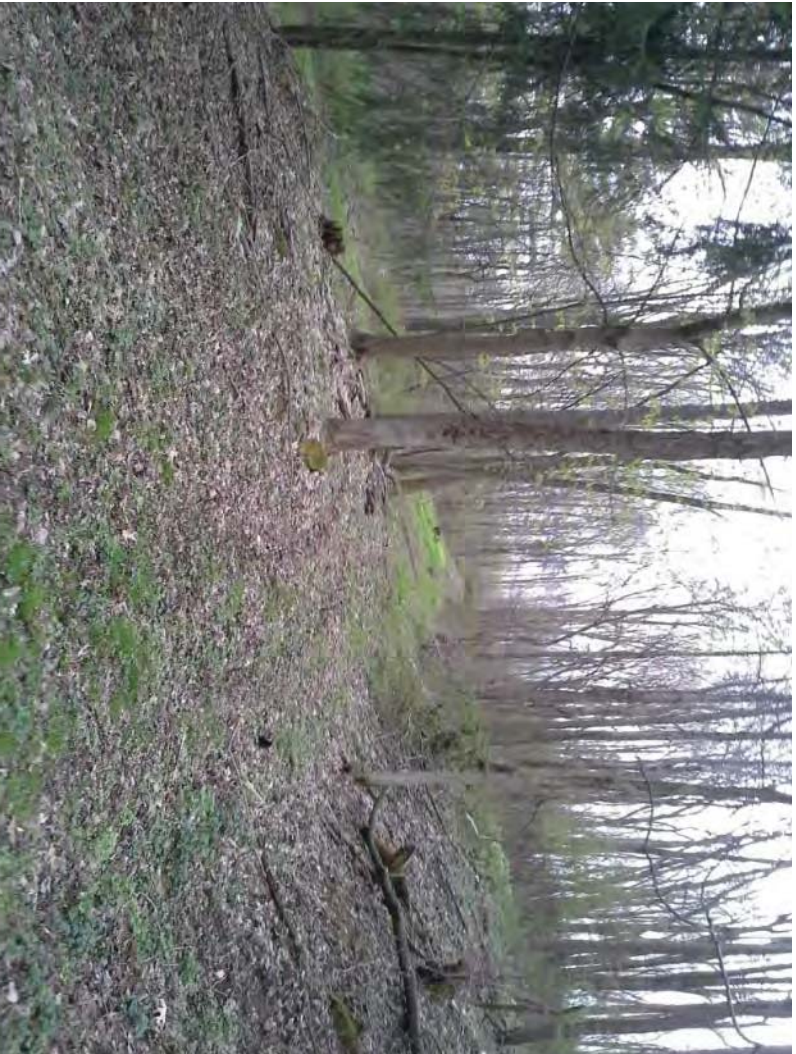
Photo 13: Farm lane in forest between SRG014/WRG011 and eastern fallow agricultural field, looking south.