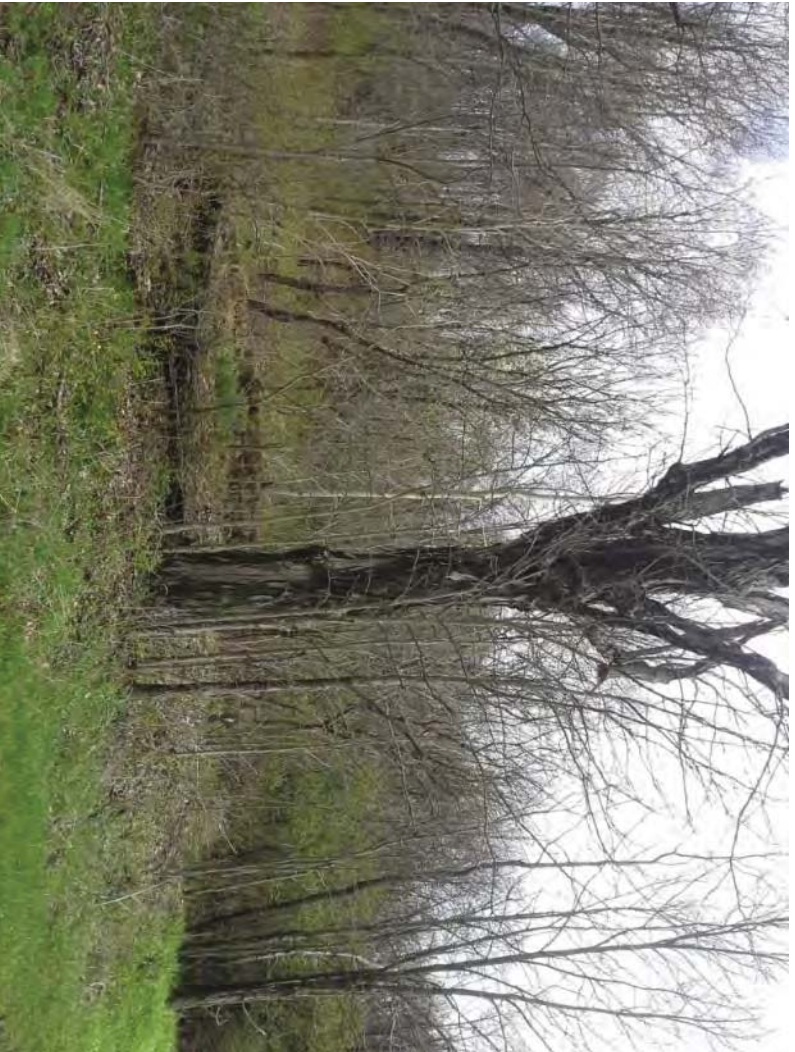
Photo 6: Shagbark habitat near south edge of environmental survey area and Pontiff Road looking east.