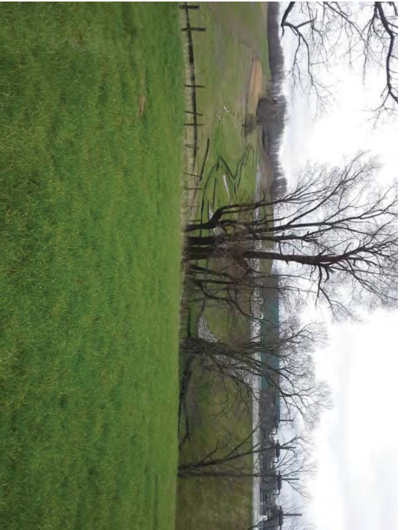
Photo 3: Pasture area looking east to Kilgore compressor station and SRG007.