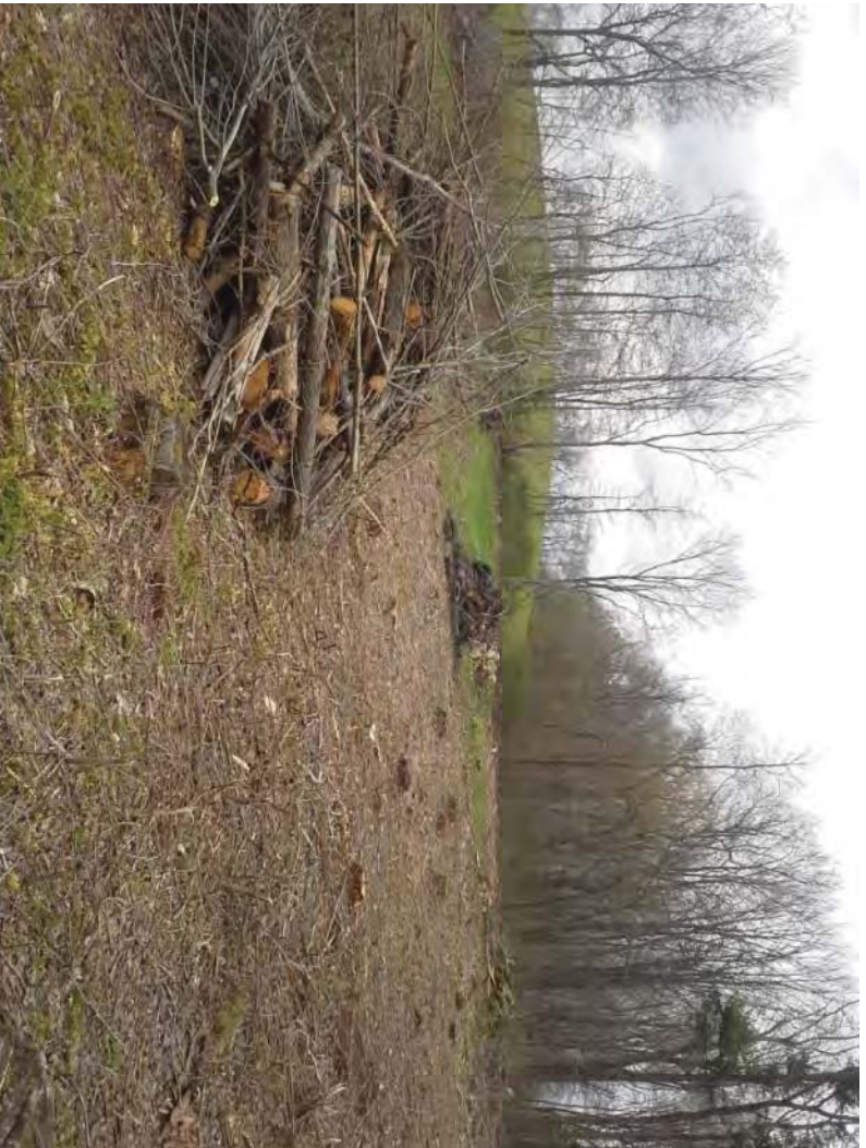
Photo 12: Cut secondary forest near proposed 138kv ROW centerline east of existing power line, looking north.