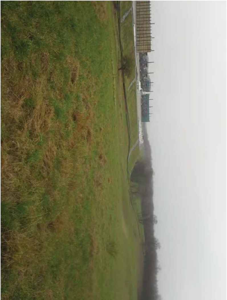
Photo 1: Northeast edge of the environmental survey area looking south to the Kilgore compressor station.