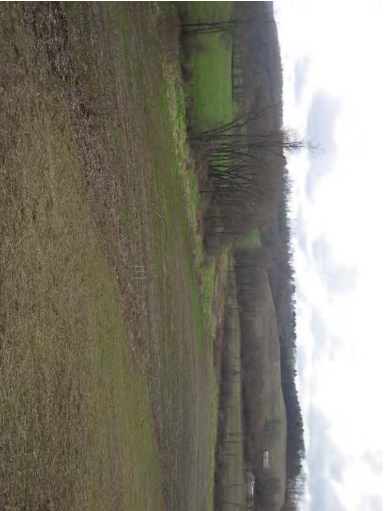
Photo 8: Proposed 138kV ROW centerline near Pontiff Road looking southwest to WRG006.