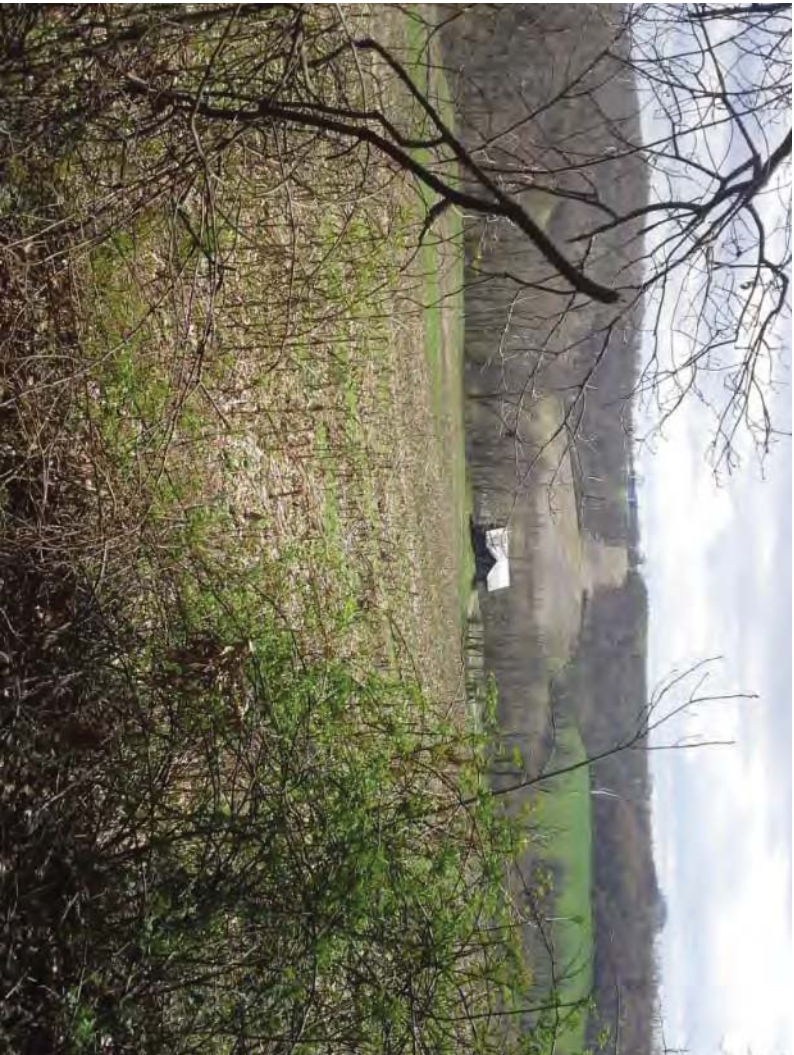
Photo 9: Access road north of proposed ROW, looking east to fallow corn field and proposed 138kV ROW.