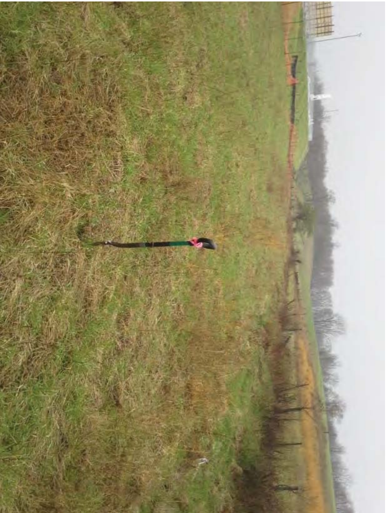
Photo 16: Upland adjacent to WRG002, looking southwest to Kilgore compressor station.