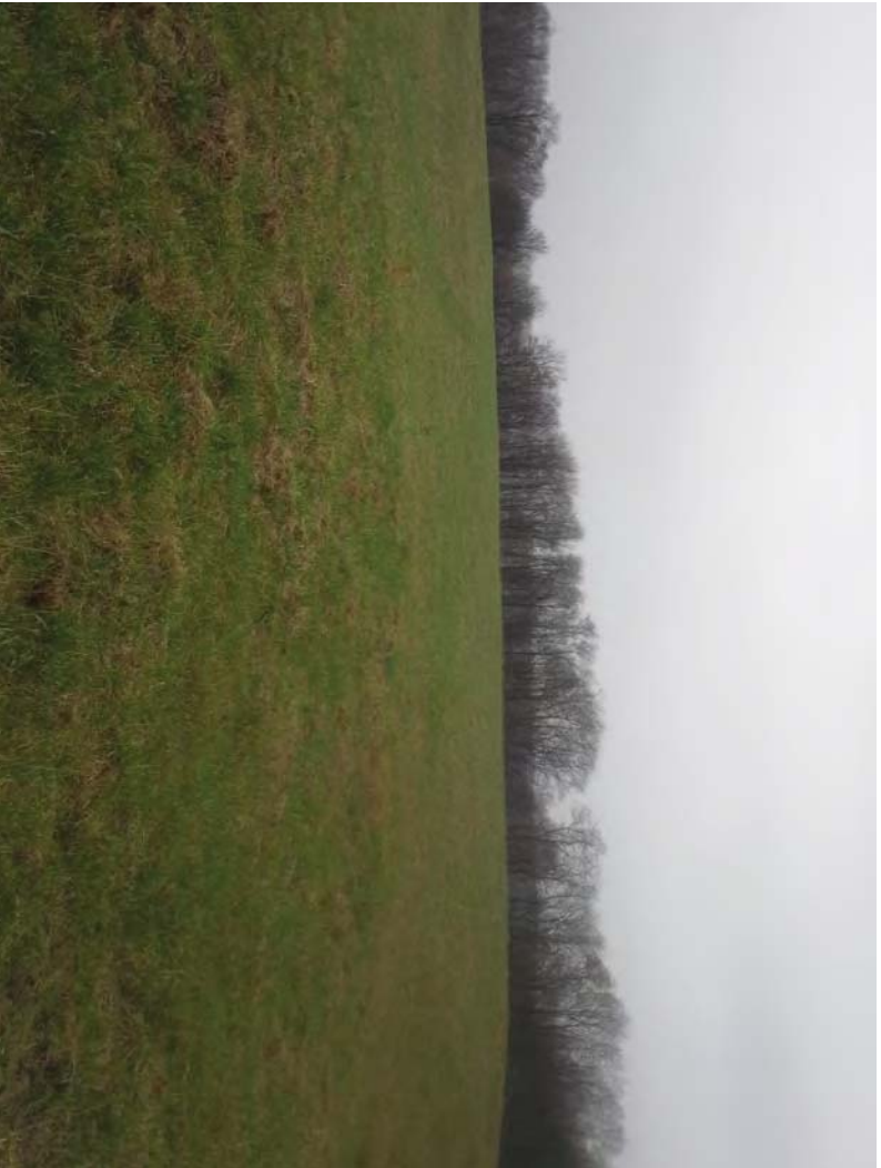
Photo 2: Northeast edge of the environmental survey area looking west towards proposed ROW.