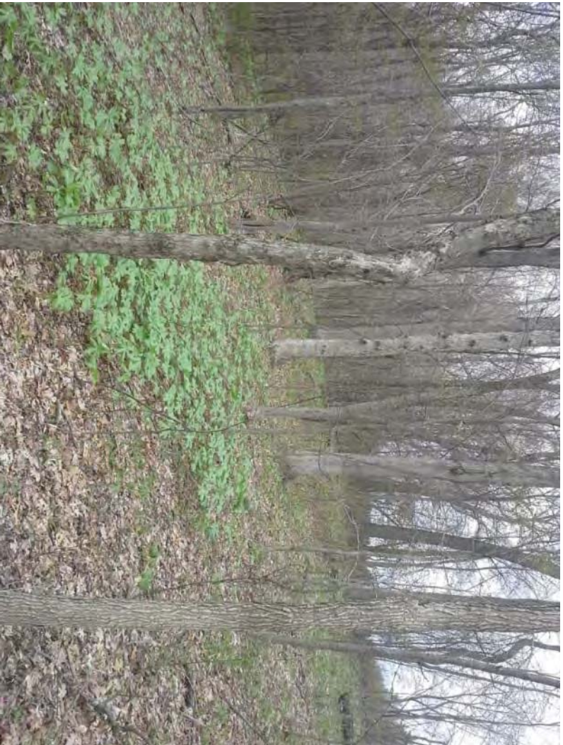
Photo 11: Proposed 138kv ROW centerline just west of tree farm, looking north.