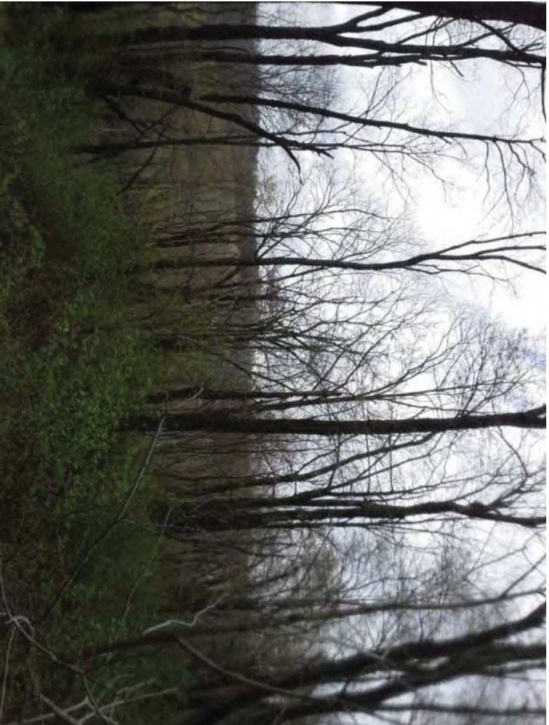
Photo 5: Forested hillside pasture west of Kilgore compressor station looking northwest.