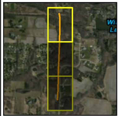
Figure 1.1. Construction Access Map. Base Gas Projects, Group 3, Line 2888.