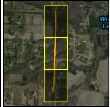
Figure 1.2. Construction Access Map. Base Gas Projects, Group 3, Line 2888.