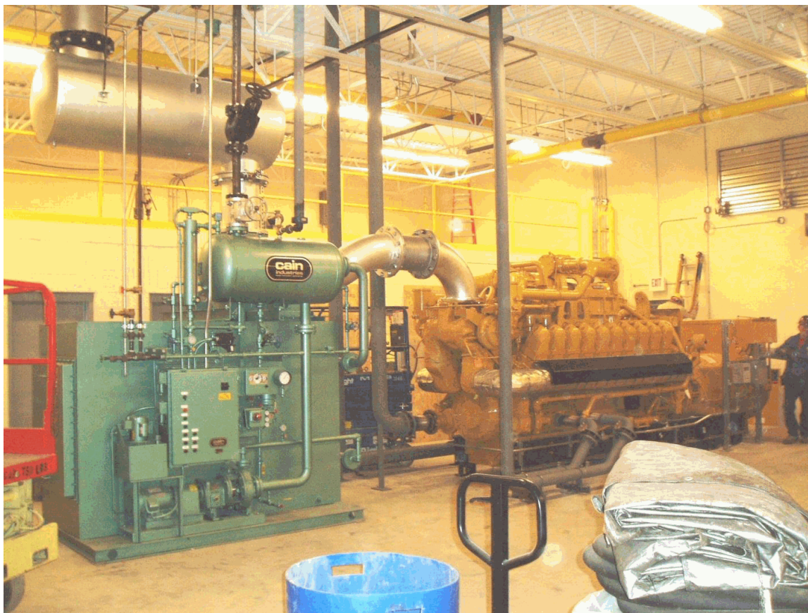
December 23, 2005