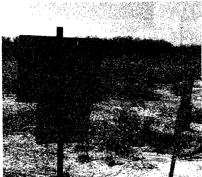
The sign reads: "This area closed to all activity other than hunting, fishing, and trapping from 8:00 p.m. to 6:00 a.m., September 1 – May 1, and 10:00 p.m. to 6:00 a.m. May 2 – August 31."

ODNR advised AEP of opposition to the transmission line and their refusal to apply to the GSA for approval for the line to cross the property, suggesting that AEP abandon plans through the PVWA and instead pursue other, less environmentally sensitive route options.