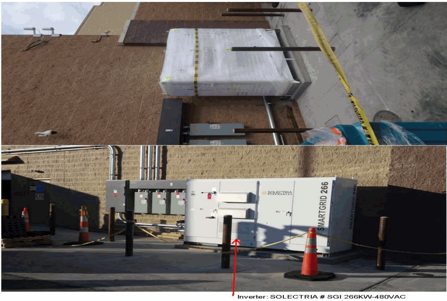
Inverter: SOLECTRIA # SGI 266KW-480VAC