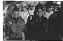
Transportation Security Administration agents walk after Terminal 2 was reopened Friday at Los Angeles International Airport.