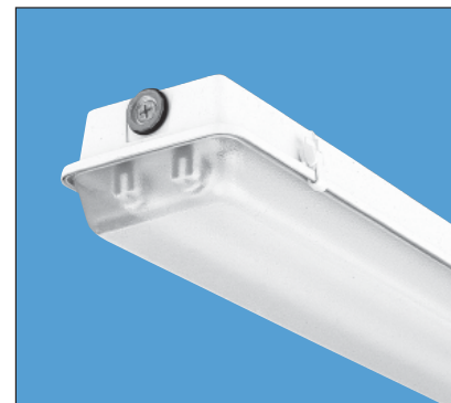
Example: DM 2 32 MVOLT GEB10IS

120V, 277V and MVOLT are UL Listed and CSA Certified (standard). See Options for 347V and NOM Certified. DM is damp location, DMW is wet location listed for covered ceiling applications. Compliance to FDA/USDA requirements and/or NSF splash-zone certification (DMW only). For more NSF information, see page 733.