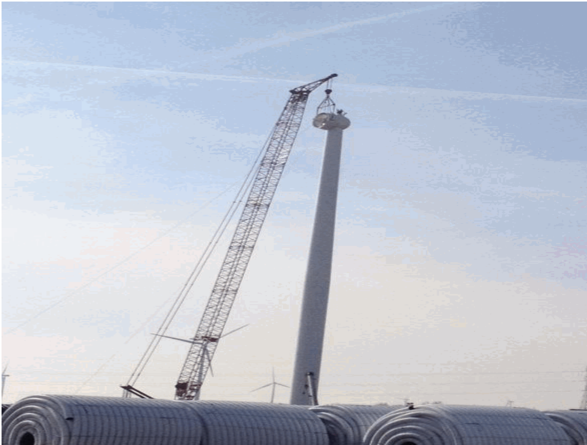
January 23, 2013