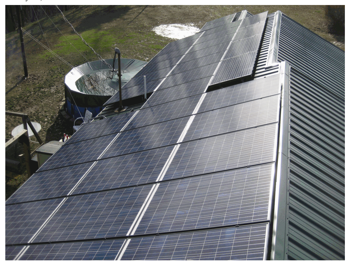
The Applicant is applying for certification in Ohio for a facility using one of the following qualified resources or technologies (Sec. 4928.01 ORC):