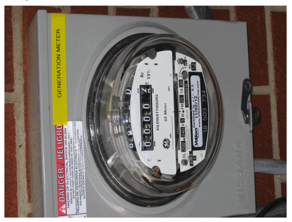
February 11, 2013

N.1.e Report the total meter reading number at the time the photograph was taken and specify the appropriate unit of generation (e.g., kWh): 2 kWh