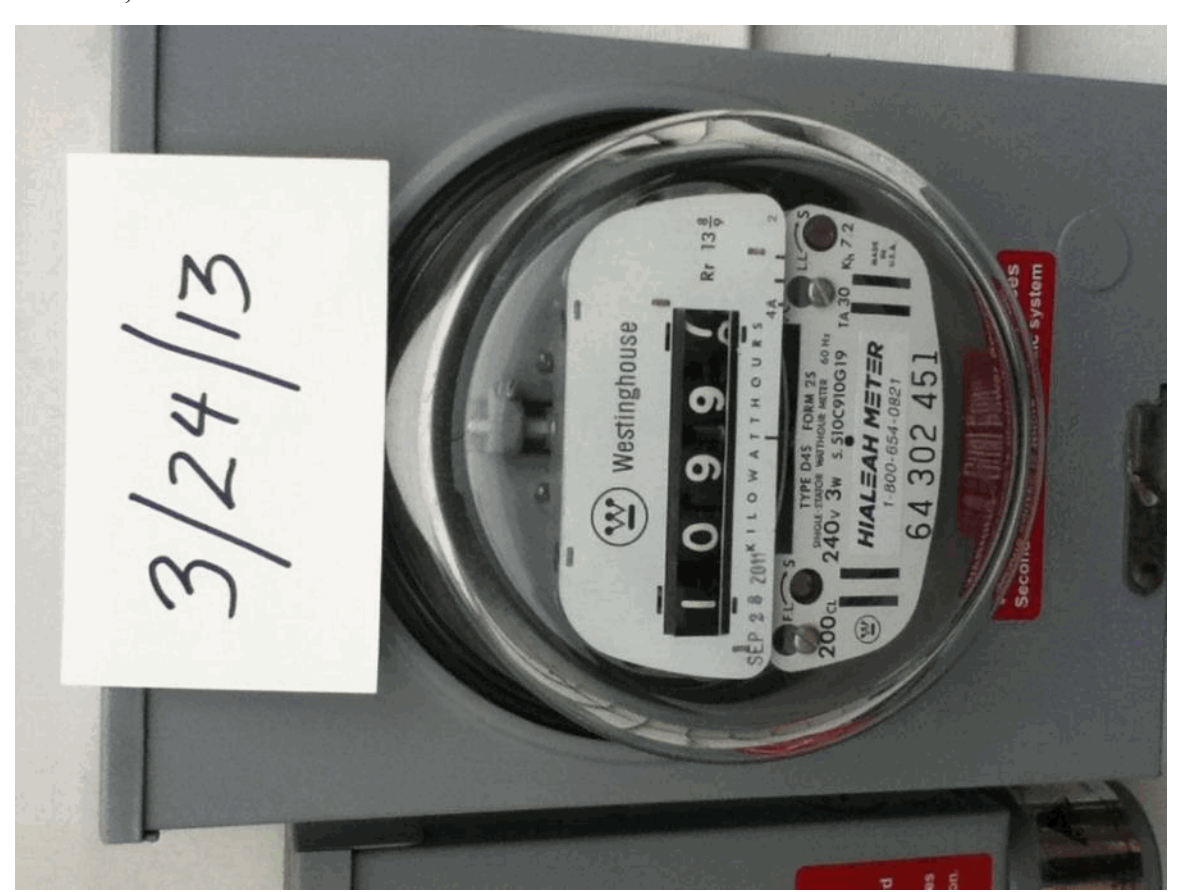
March 24, 2013

N.1.e Report the total meter reading number at the time the photograph was taken and specify the appropriate unit of generation (e.g., kWh): 1099.0 KWH