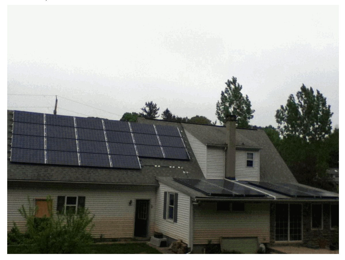
The Applicant is applying for certification in Ohio for a facility using one of the following qualified resources or technologies (Sec. 4928.01 ORC):