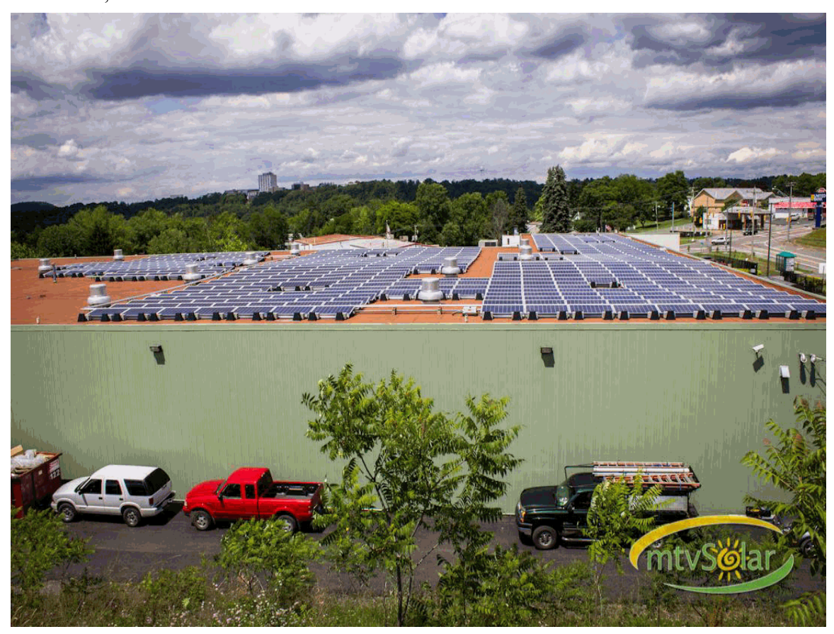
The Applicant is applying for certification in Ohio for a facility using one of the following qualified resources or technologies (Sec. 4928.01 ORC):