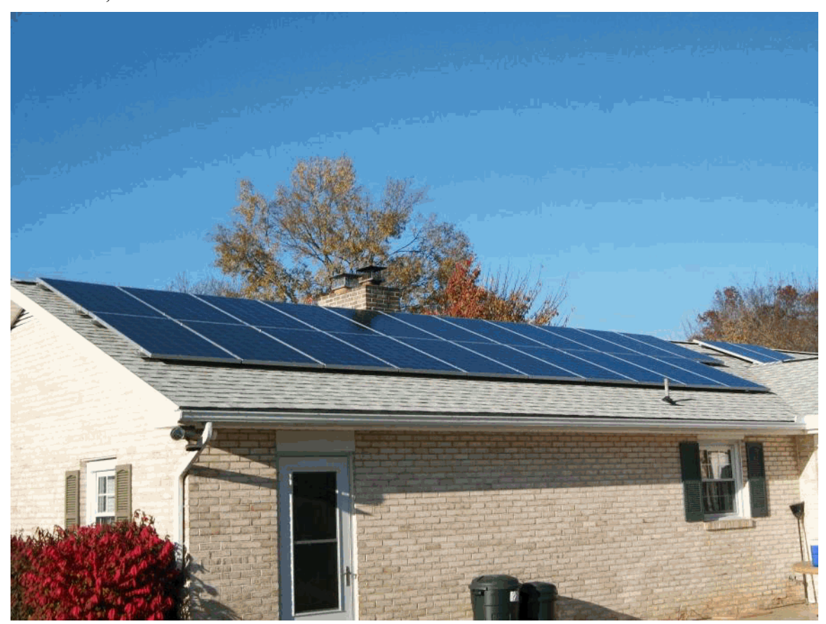
The Applicant is applying for certification in Ohio for a facility using one of the following qualified resources or technologies (Sec. 4928.01 ORC):