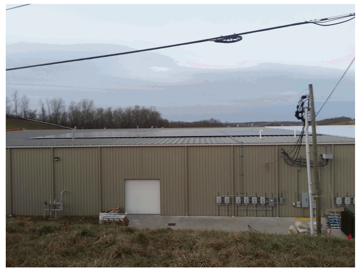
January 19, 2013

The Applicant is applying for certification in Ohio for a facility using one of the following qualified resources or technologies (Sec. 4928.01 ORC):