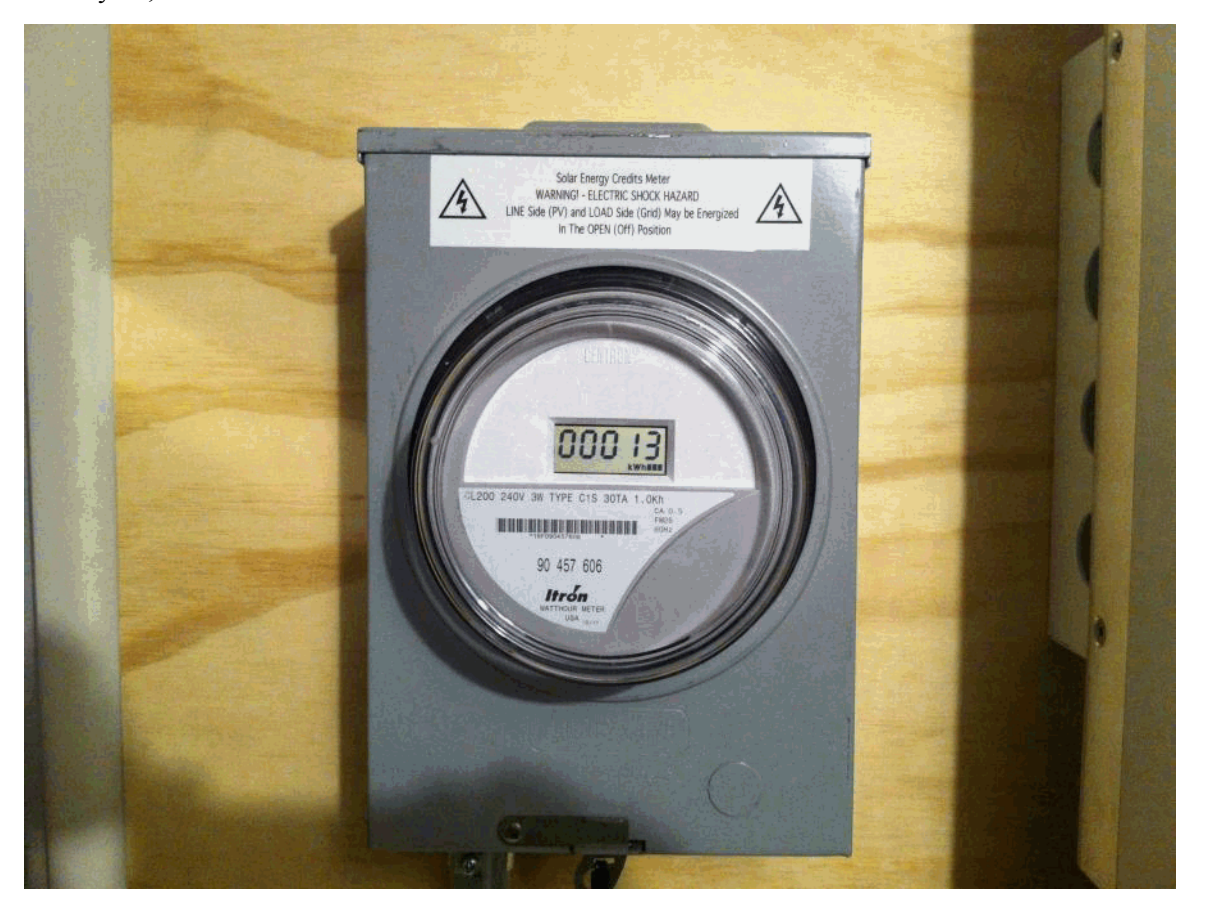
January 03, 2013

N.1.e Report the total meter reading number at the time the photograph was taken and specify the appropriate unit of generation (e.g., kWh): 13.0 KWH