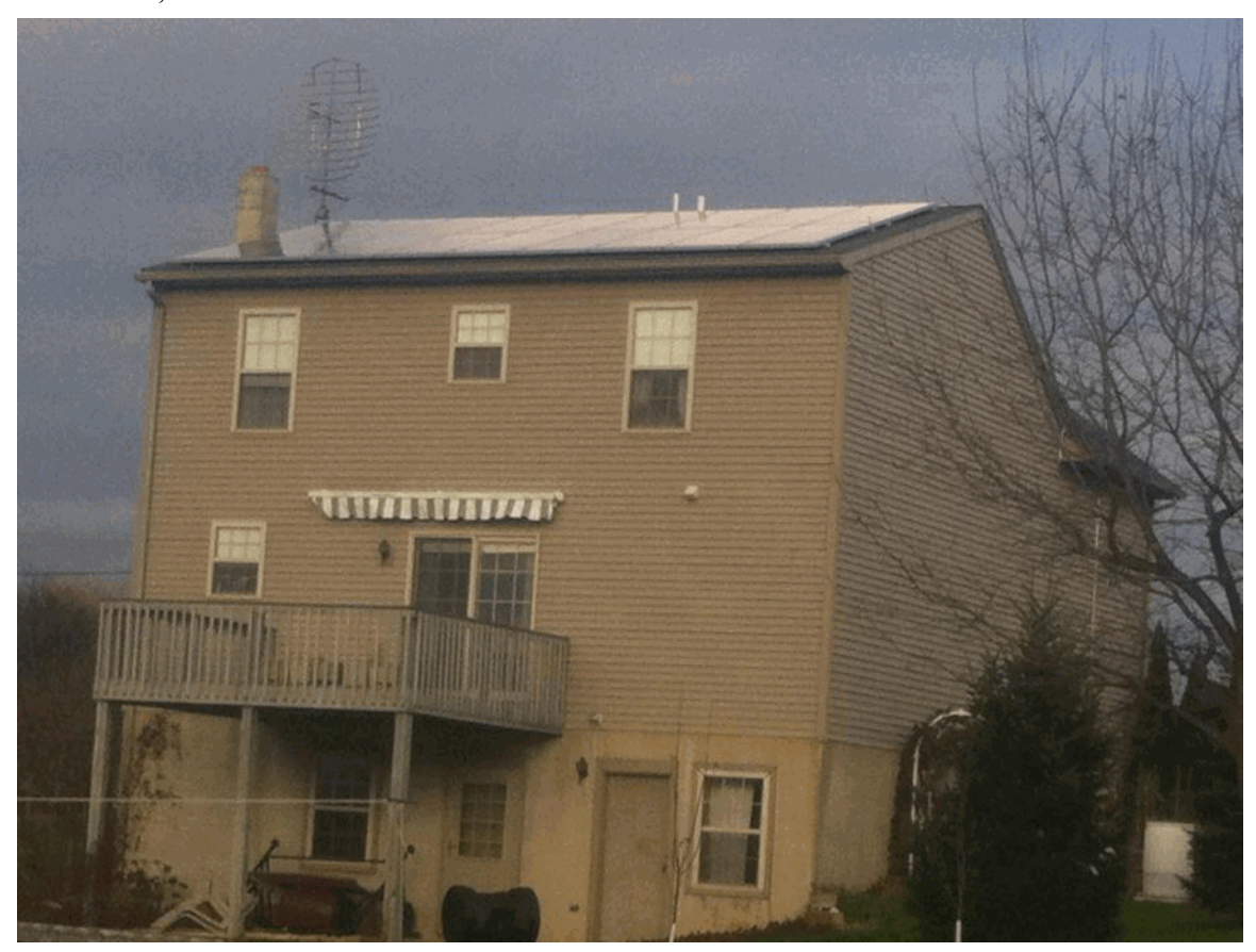
The Applicant is applying for certification in Ohio for a facility using one of the following qualified resources or technologies (Sec. 4928.01 ORC):