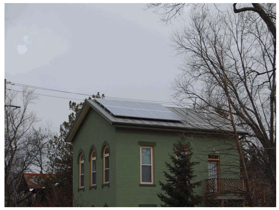
January 14, 2013

The Applicant is applying for certification in Ohio for a facility using one of the following qualified resources or technologies (Sec. 4928.01 ORC):