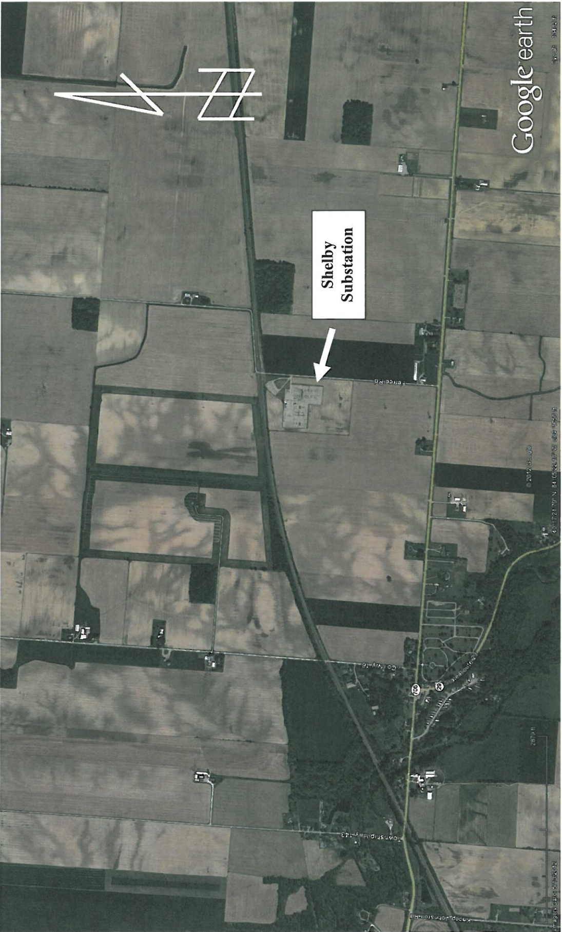
Exhibit – 1 Shelby Substation – Aerial