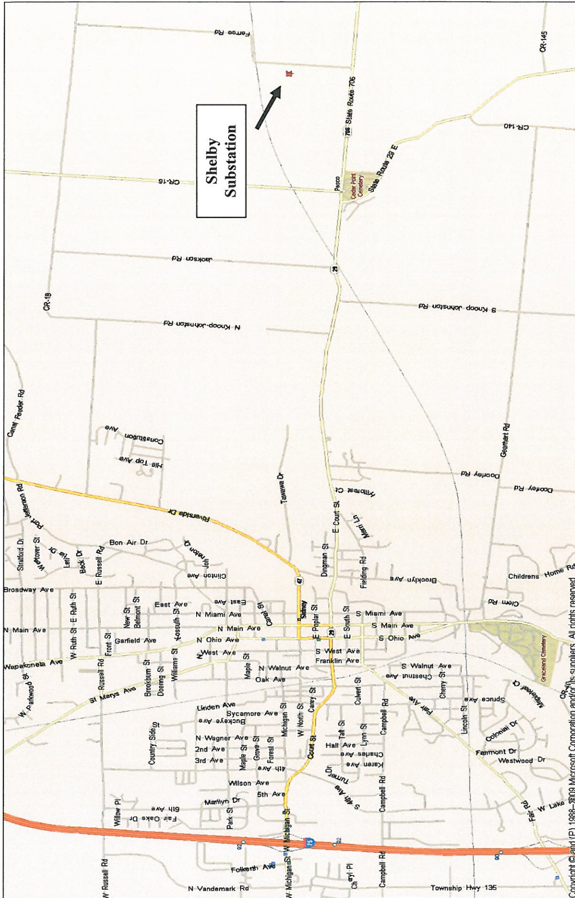
Exhibit 4 Shelby Substation – Area Map