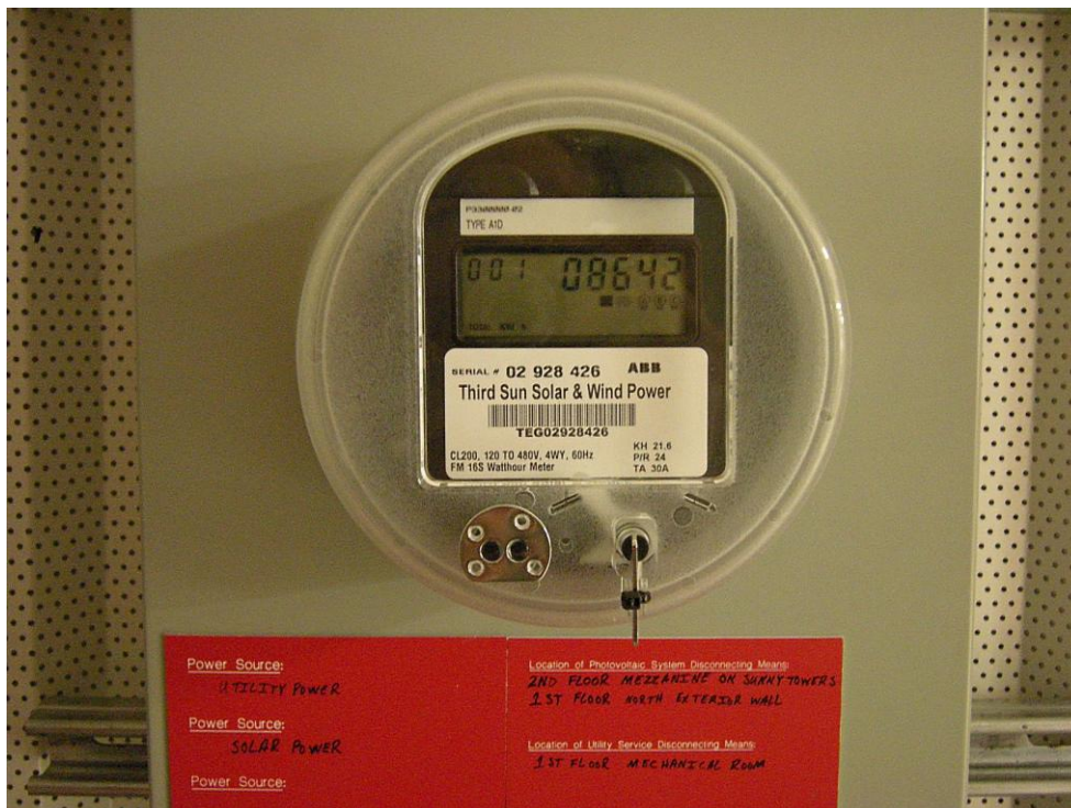
Figure 2 Taken 9/12/11