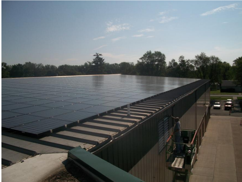
Figure 1 Taken 9/12/11