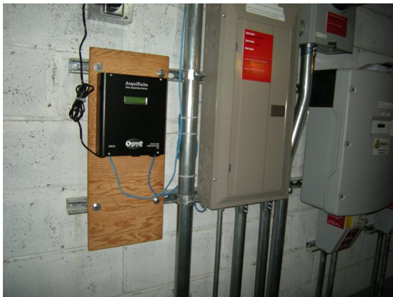
Figure 4 Taken 5/25/10