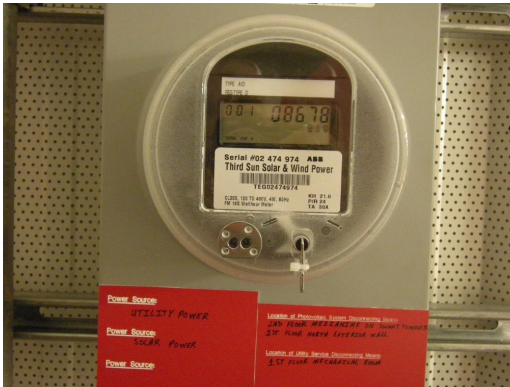
Figure 3 Taken 9/12/11