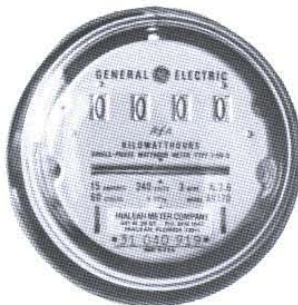
TYPICAL METER WITH EZ READ DIAL. Add E to catalog number below.

OK for 120 volt, 2 wire circuits, too! Ask for diagram R-2S-2 Except in California