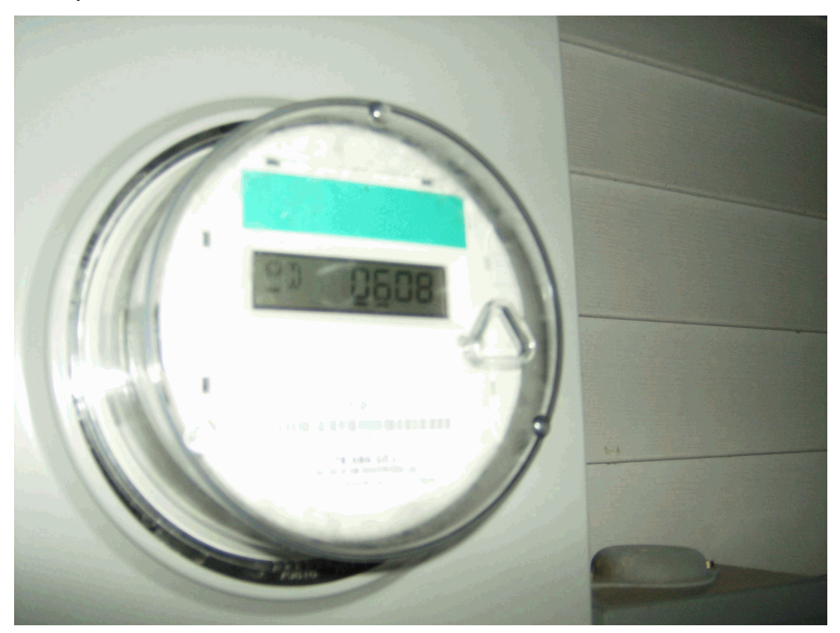
February 23, 2011

N.1.e Report the total meter reading number at the time the photograph was taken and specify the appropriate unit of generation (e.g., kWh): 608kwh