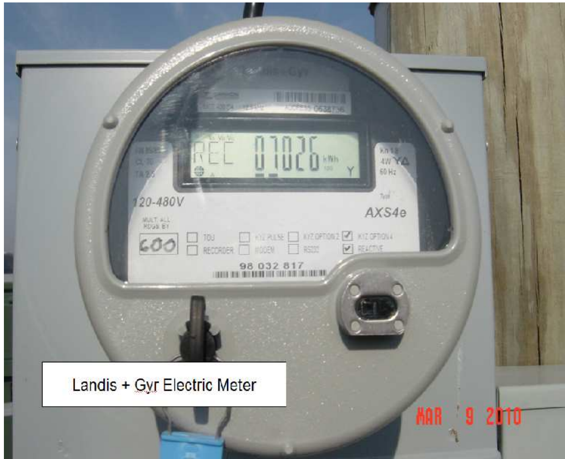
Landis + Gyr Electric Meter

The Public Utilities Commission of Ohio reserves the right to verify the accuracy of the data reported to the tracking system and to the PUCO.