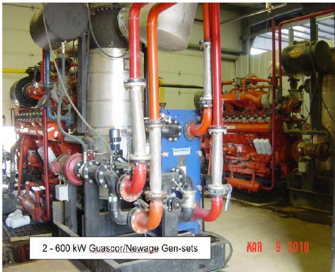
2 - 600 kW Guascor/Newage Gen-sets