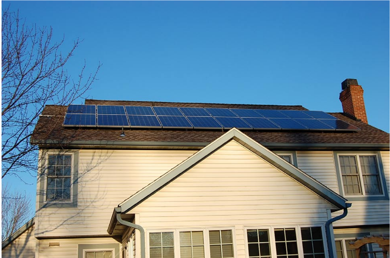
Photograph taken 2/1/10

The Applicant is applying for certification in Ohio based on the following qualified resource or technology (Sec. 4928.01 O.R.C.):