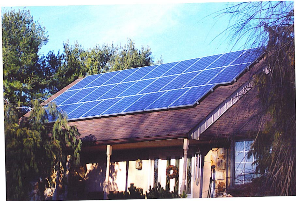
Photograph taken 1/24/10

The Applicant is applying for certification in Ohio based on the following qualified resource or technology (Sec. 4928.01 O.R.C.):