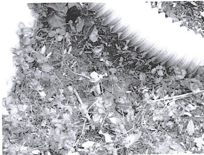
Ground copper wire for modules and racking grounding