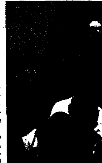
LONNIE TEMMONS III | PLAIN DEALER

To reach this Plain Dealer reporter: rdissell@plaind.com , 216-999-4121