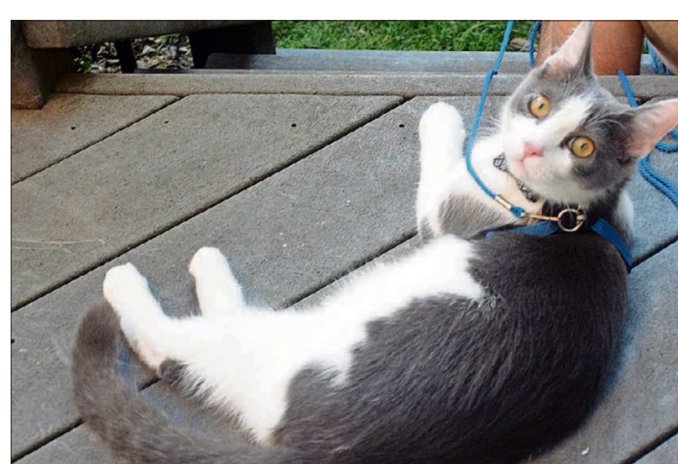
Pip, our 11-month-old kitten: "Whaddya mean my litter box stinks?"

First, the smell. I'm sorry, but in my not-soprofessional opinion, none of the brands kill the odor completely.