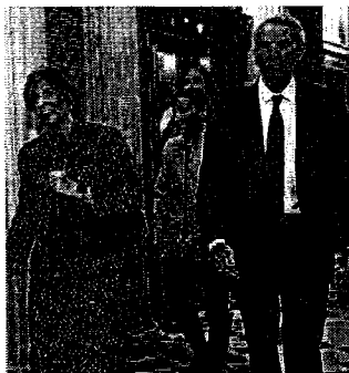
U.S. Sens. Joni Ernst, R-Iowa, and Rob Portman, R-Ohio, head to the Senate floor last week prior to a vote on ending the partial government shutdown.

Portman, Ohio's junior senator, has been one of Congress' most vocal supporters of passing legislation to stop closures like the one that